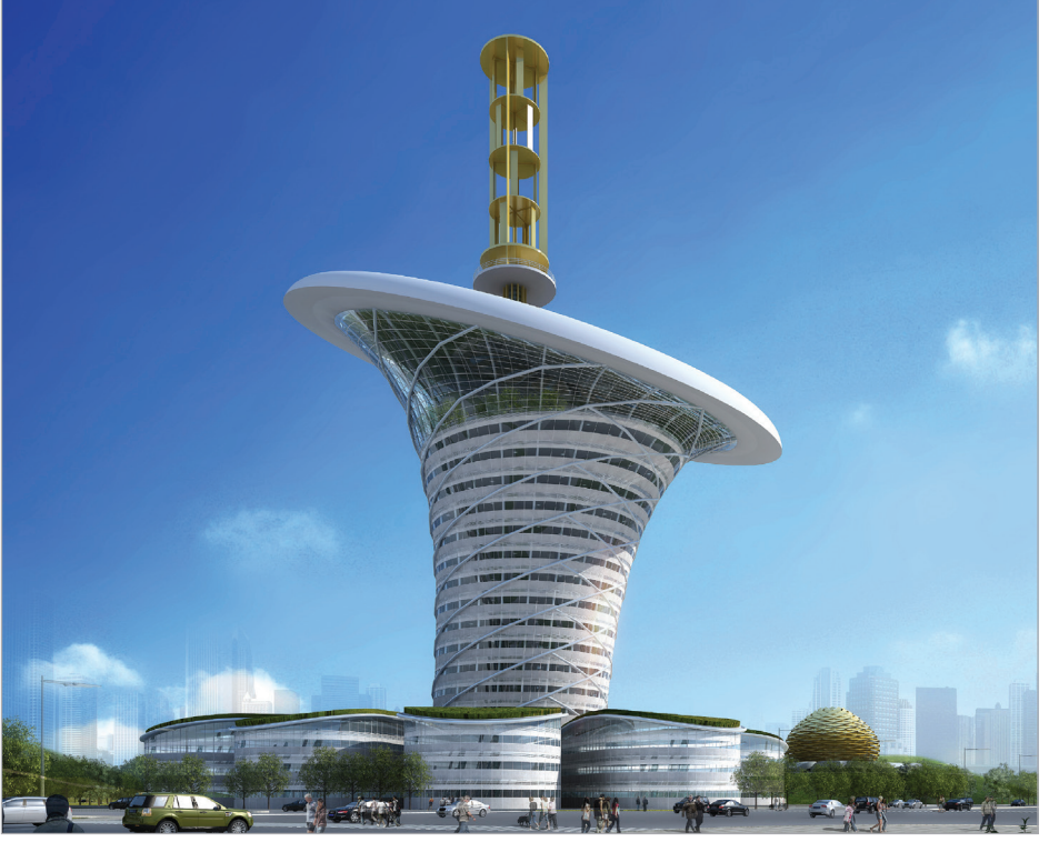
Nemetschek Structural User Contest 2013 - Category 1: Buildings